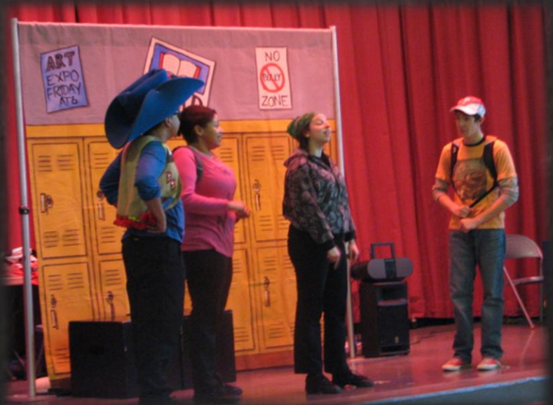
Walnut Street Theater