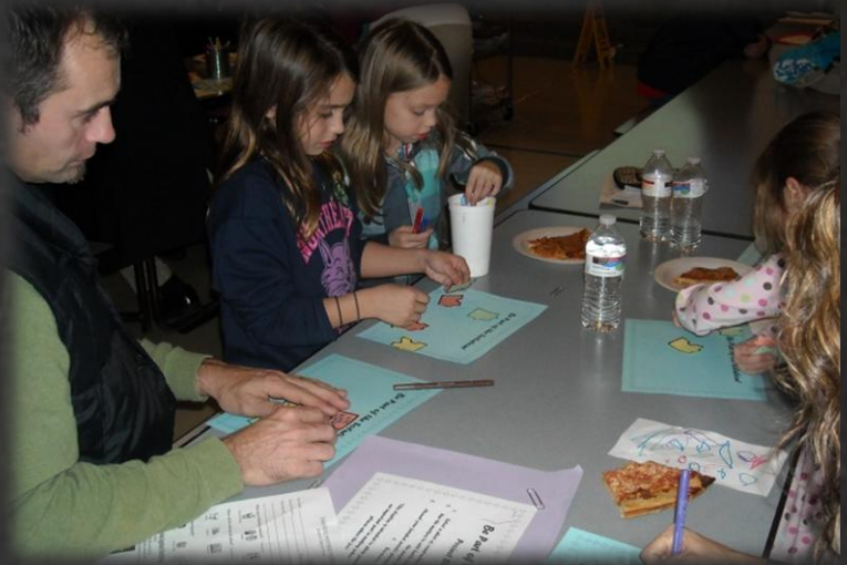
Panther Patrol Family Night

Earlier this year the Parkside Panther Patrol Committee developed and hosted a Panther Patrol Family Night to help parents and students understand how Parkside Elementary is committed to providing a caring and safe environment for everyone. In addition to family night, the Panther Patrol Committee, with the help of the Parkside PTL, presented an assembly by the Walnut Street Theater of Philadelphia on bully prevention. The Panther Patrol Committee members volunteer to meet regularly in an effort to facilitate a variety of school programs that promote a positive school climate at Parkside Elementary. Thank you to the committee members for their work throughout the year and to the Parkside PTL for supporting and funding school climate programs.