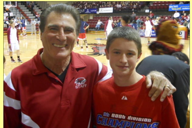
Eagle's great, Vince Papale, met with NMS Students at St. Joe's